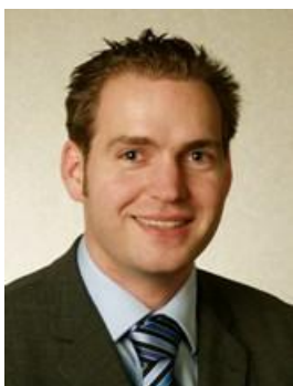
Michael Aufenanger Mayor of Ahnatal